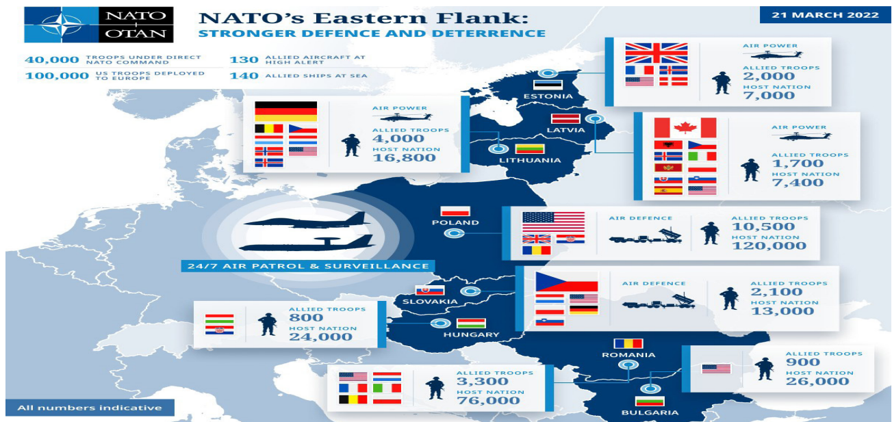
Figure 1: The Distribution of NATO Forces in Eastern and Southeastern Europe After March 2022

in the Baltic Sea and the Mediterranean (see Figure 1). Despite declining confidence in NATO in recent years, especially among European quarters, the Russian invasion of Ukraine has contributed to breathing new life into the alliance. The invasion has forced NATO to adjust and develop new initiatives/strategies in light of Moscow's aggression and threats.