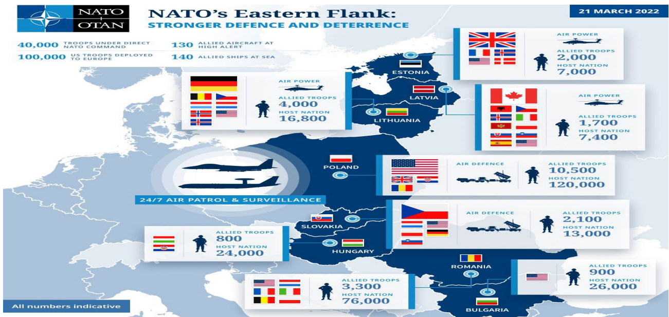
Figure 1: The Distribution of NATO Forces in Eastern and Southeastern Europe After March 2022

in the Baltic Sea and the Mediterranean (see Figure 1). Despite declining confidence in NATO in recent years, especially among European quarters, the Russian invasion of Ukraine has contributed to breathing new life into the alliance. The invasion has forced NATO to adjust and develop new initiatives/strategies in light of Moscow's aggression and threats.