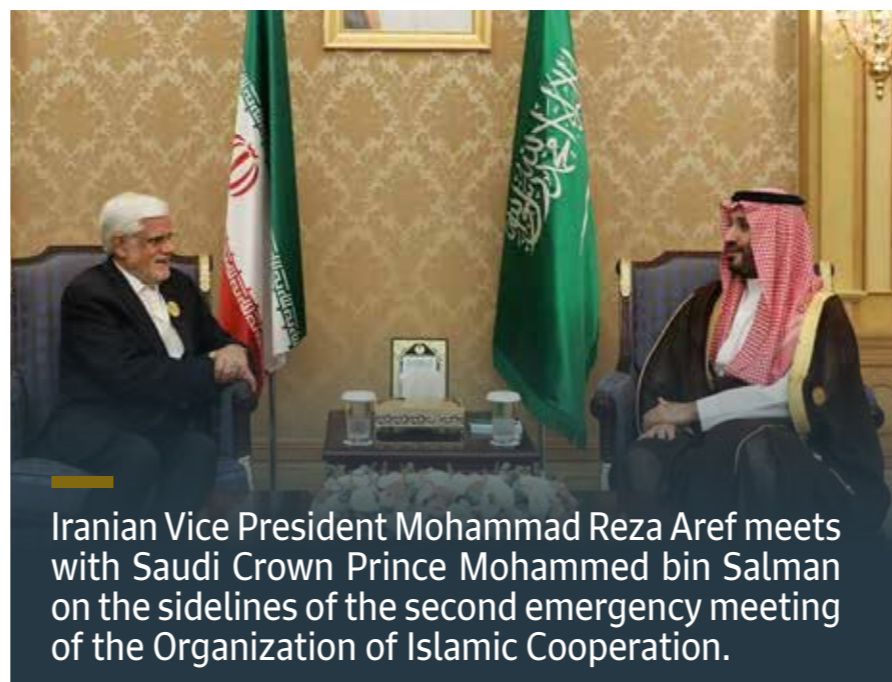
Iranian Vice President Mohammad Reza Aref meets with Saudi Crown Prince Mohammed bin Salman on the sidelines of the second emergency meeting of the Organization of Islamic Cooperation.