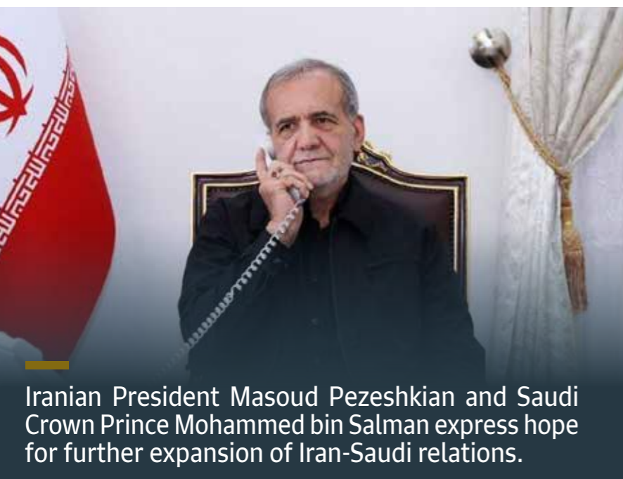
Iranian President Masoud Pezeshkian and Saudi Crown Prince Mohammed bin Salman express hope for further expansion of Iran-Saudi relations.

Pezeshkian: "It makes no difference to us who won the US elections, as our country and system rely on their internal strength and on our dear people."