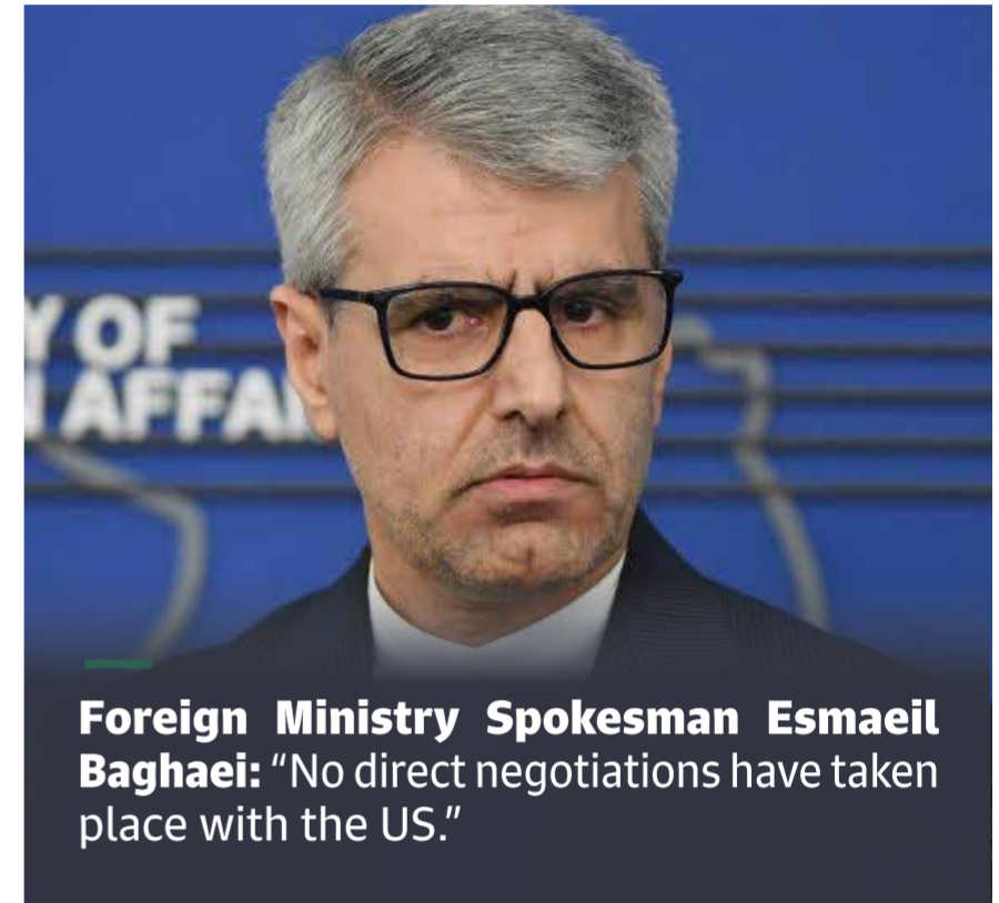
Foreign Ministry Spokesman Esmail Baghaei: "No direct negotiations have taken place with the US."