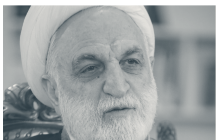
Chief Justice Gholam-Hossein Mohseni-Ejei: "Swift prosecution of traitors is essential for societal stability."