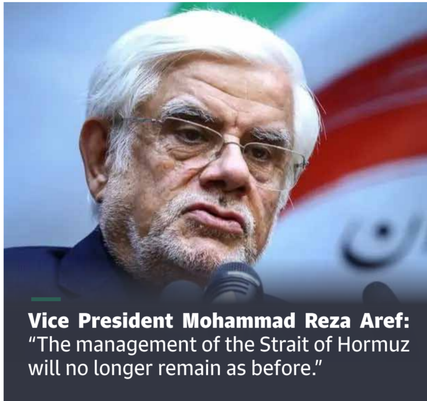
Vice President Mohammad Reza Aref: "The management of the Strait of Hormuz will no longer remain as before."