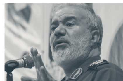
IRGC adviser Ali Fadavi: "The United States has shifted from ambitions of destroying Iran to pursuing minimal objectives."