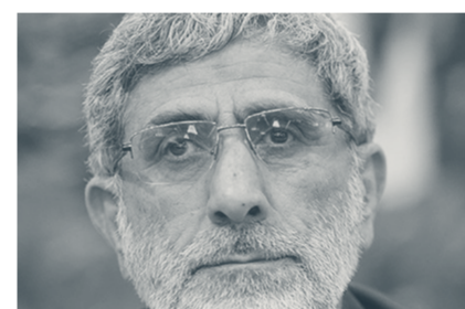
Quds Force Commander Esmail Qaani: "The United States and Israel must adapt to a new regional order."