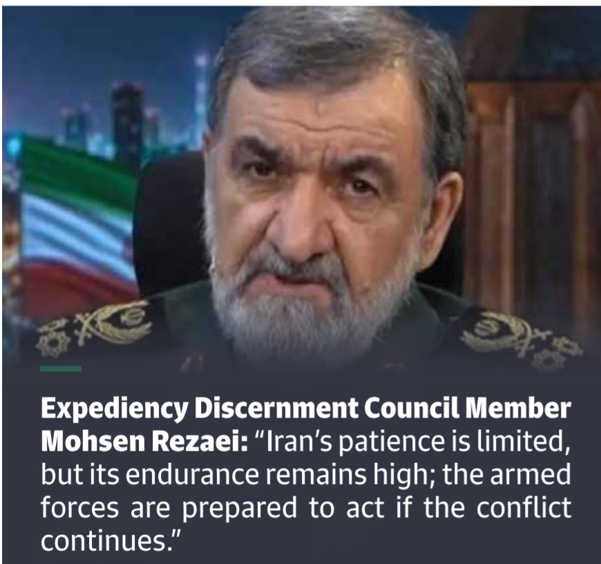
Expediency Discernment Council Member Mohsen Rezaei: "Iran's patience is limited, but its endurance remains high; the armed forces are prepared to act if the conflict continues."