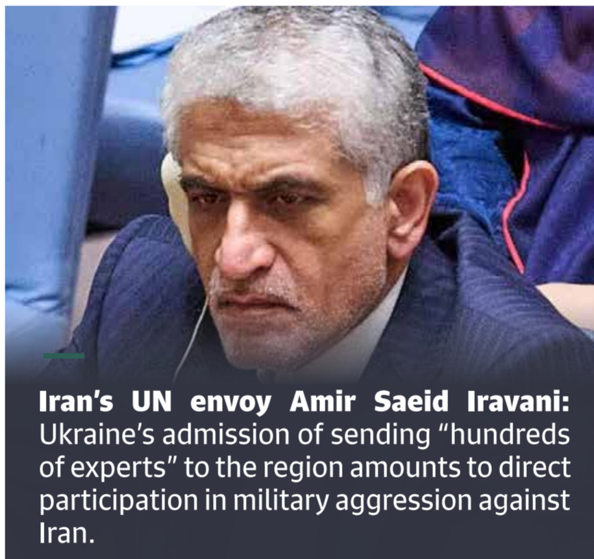
Iran's UN envoy Amir Saeid Irvani: Ukraine's admission of sending "hundreds of experts" to the region amounts to direct participation in military aggression against Iran.