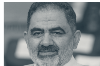
Navy Commander Shahram Irani: "Eastern Hormuz and the Sea of Oman are under full Iranian naval control."