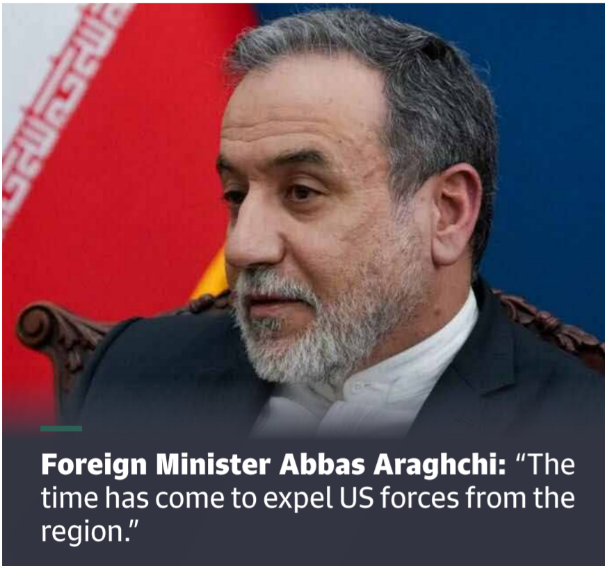
Foreign Minister Abbas Araghchi: "The time has come to expel US forces from the region."