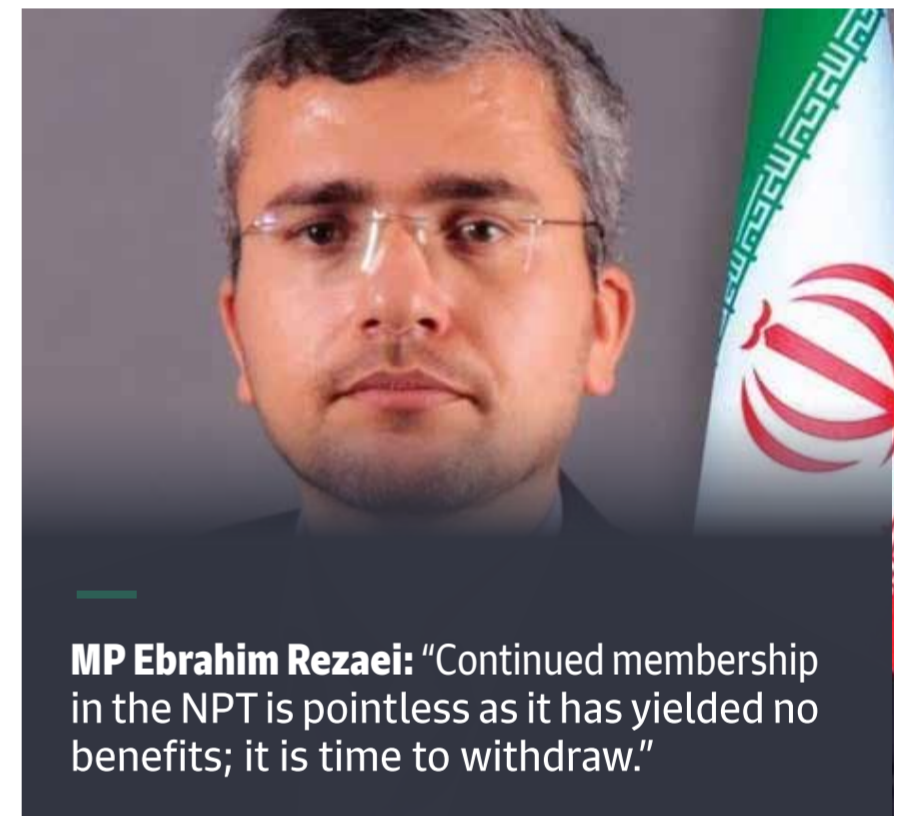
MP Ebrahim Rezaei: "Continued membership in the NPT is pointless as it has yielded no benefits; it is time to withdraw."