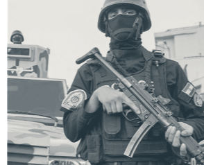
The Greater Tehran Police Media Center: The police announced the arrest of an individual accused of gathering and transmitting information abroad.