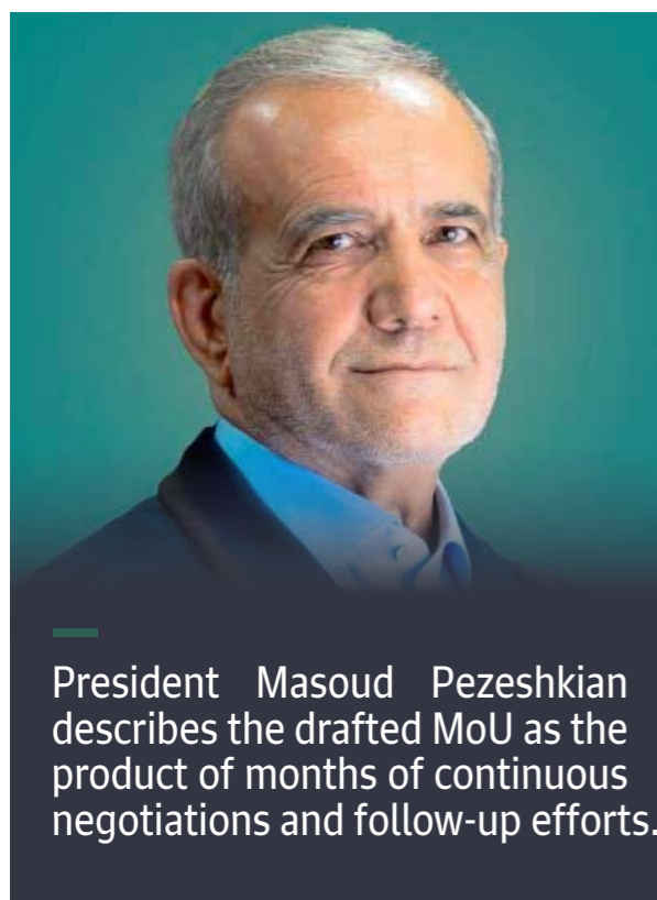
President Masoud Pezeshkian describes the drafted MoU as the product of months of continuous negotiations and follow-up efforts.