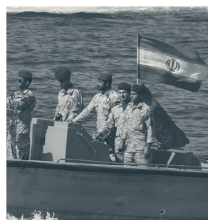
IRGC Navy: The force announced that, following what it described as recent hostile actions by the US military in the region that had endangered the security of oil tankers and commercial vessels in the Arabian Gulf and the Sea of Oman, the Strait of Hormuz had been completely closed.