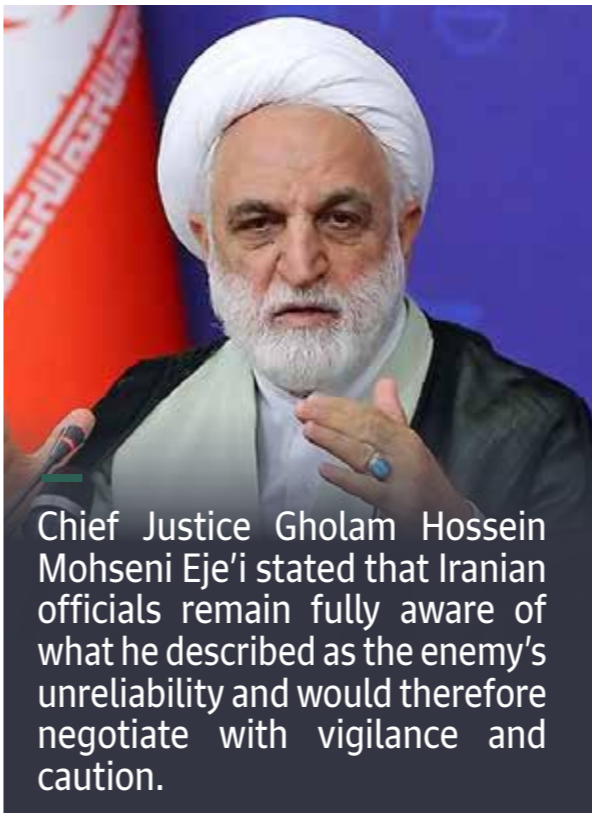
Chief Justice Gholam Hossein Mohseni Eje'i stated that Iranian officials remain fully aware of what he described as the enemy's unreliability and would therefore negotiate with vigilance and caution.