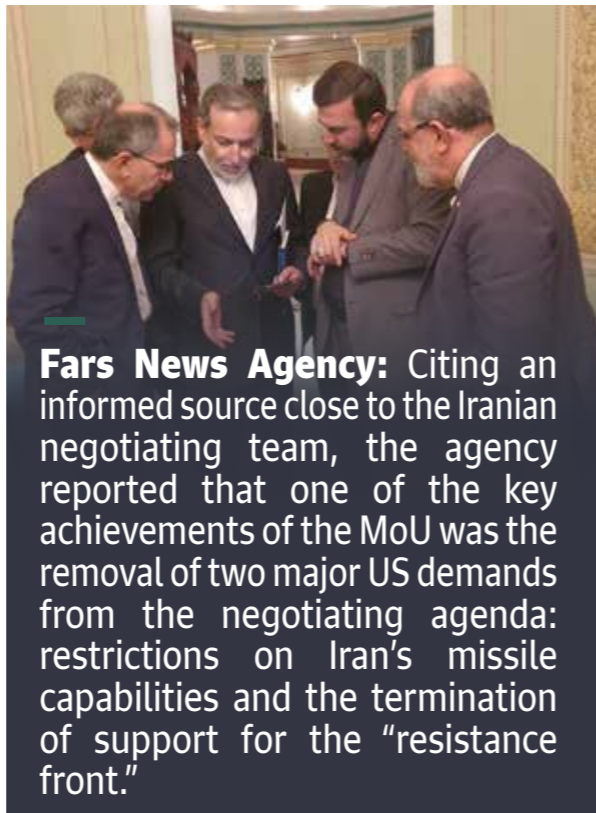
Fars News Agency: Citing an informed source close to the Iranian negotiating team, the agency reported that one of the key achievements of the MoU was the removal of two major US demands from the negotiating agenda: restrictions on Iran's missile capabilities and the termination of support for the "resistance front."