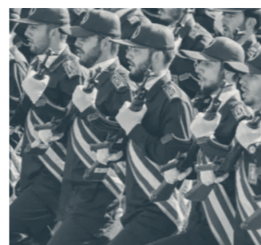
IRGC Public Relations: "We had targeted the Azraq base, including facilities used by US F-35, F-15 and F-16 fighter aircraft, as well as an air control center, with 12 ballistic missiles."