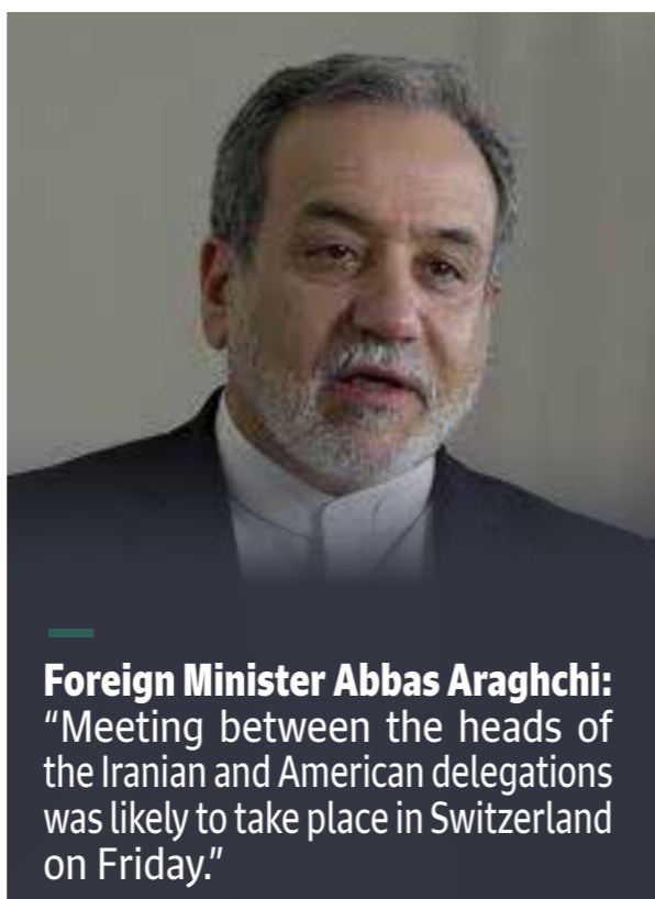
Foreign Minister Abbas Araghchi: "Meeting between the heads of the Iranian and American delegations was likely to take place in Switzerland on Friday."